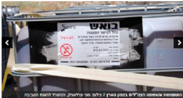
In an inspection tour conducted by the Israeli Ministry of Environmental Protection in September 2013, tankers containing the Skunk liquid were found stored in a field in the Golan Heights. According to the manufacturer's safety data sheet, containers must be stored in a closed and well-ventilated area and not exposed to sunlight. 65 Photo by the Ministry of Environmental Protection. 66

The Skunk was developed by the Technological Development Department of the Israel Police, in collaboration with Odortec LTD an Israeli company that specializes in the research and development of scent-based repellents for law enforcement. In an article from 2008, the head of the police department in charge of developing the Skunk noted that the police and Odortec were conducting negotiations so that Odortec would be the supplier, and in return the Israel Police would enjoy a considerable discount. 63 The Israeli police and Odortec are currently considering the development of a personal Skunk for police officers 64 .