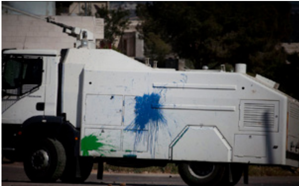
Protest against the occupation, Nabi Saleh, 20 April 2012.