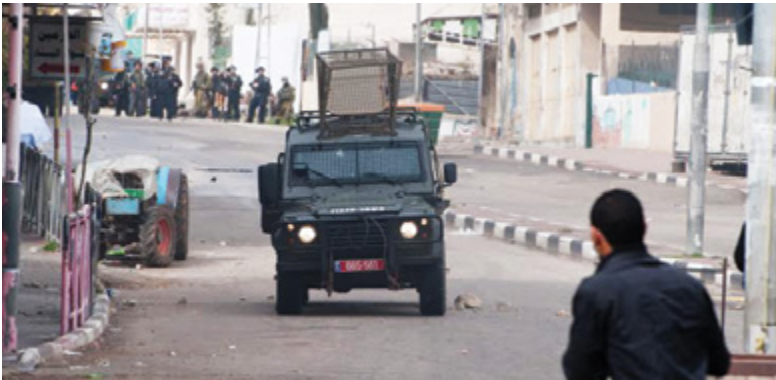
Protest calling to open the Shuhada street in Hebron, West Bank, 24.02.2011

The “Scream” device was first used in the West Bank in June 2005, during a demonstration in Bil’in against the Separation Wall. 33 On that occasion, the Israeli army used an “anti-riot system” called “SHOPHAR - The Scream,” 34 manufactured by the Israeli company Electro-Optics Research & Development (EORD). On its website, the company describes the system as “a compact, jeep mounted, acoustic system that radiates a narrow, high power steerable acoustic beam designed to be used as