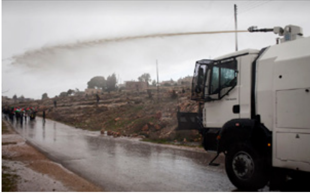
Demonstration against the occupation, Nabi Saleh, 13 January 2012. The model of the truck is noted beneath the driver's window: TGM 18.290 – one of MAN's models.