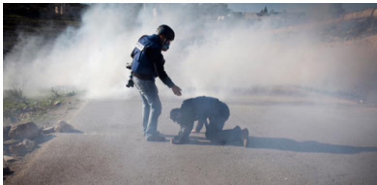
Demonstration in Nabi Saleh, West Bank, 23.12.2011

Systems, Inc. 17 According to the manufacturer, the model is “designed to penetrate intermediate barriers of moderate density such as windows, interior dry wall and interior doors. The projectile breaks upon impact and delivers an agent payload of powder or liquid throughout the target area.” 18 The primary purpose of these canisters is to penetrate barriers, with a secondary function of releasing a chemical gas. 19