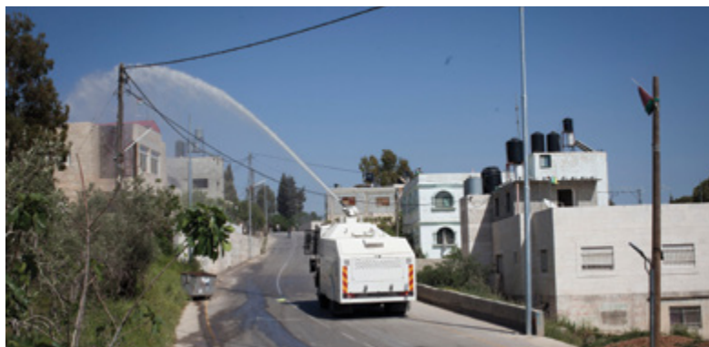
The Israeli army spraying the Skunk liquid into homes in Nabi Saleh, West Bank, 20.4.2012

is so strong that it broke the window of a sprayed house. 76 According to B'Tselem, such actions raise grave concerns that Israeli security forces use the Skunk as “a collective punitive measure” against the Palestinian residents of villages where regular weekly demonstrations are held. 77